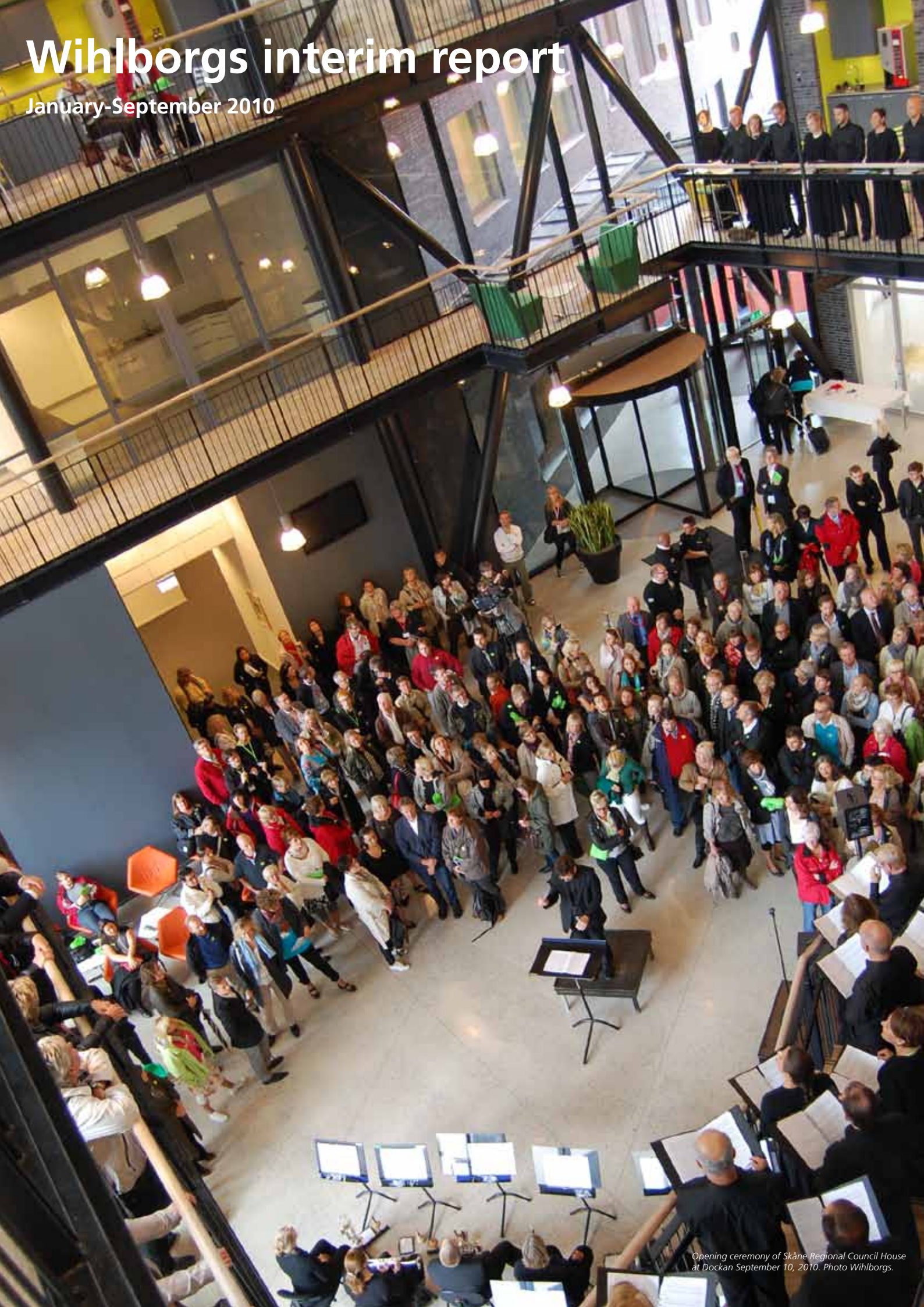
Opening ceremony of Skåne Regional Council House at Dockan September 10, 2010.