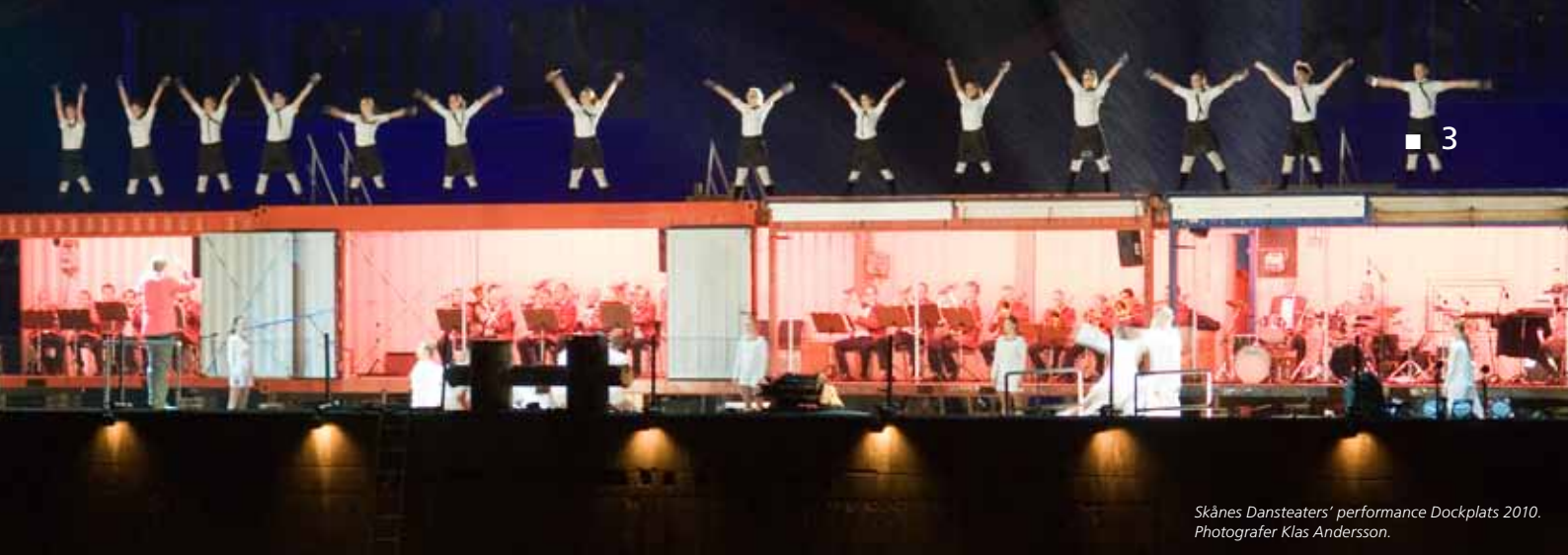
Skånes Dansteaters' performance Dockplats 2010.