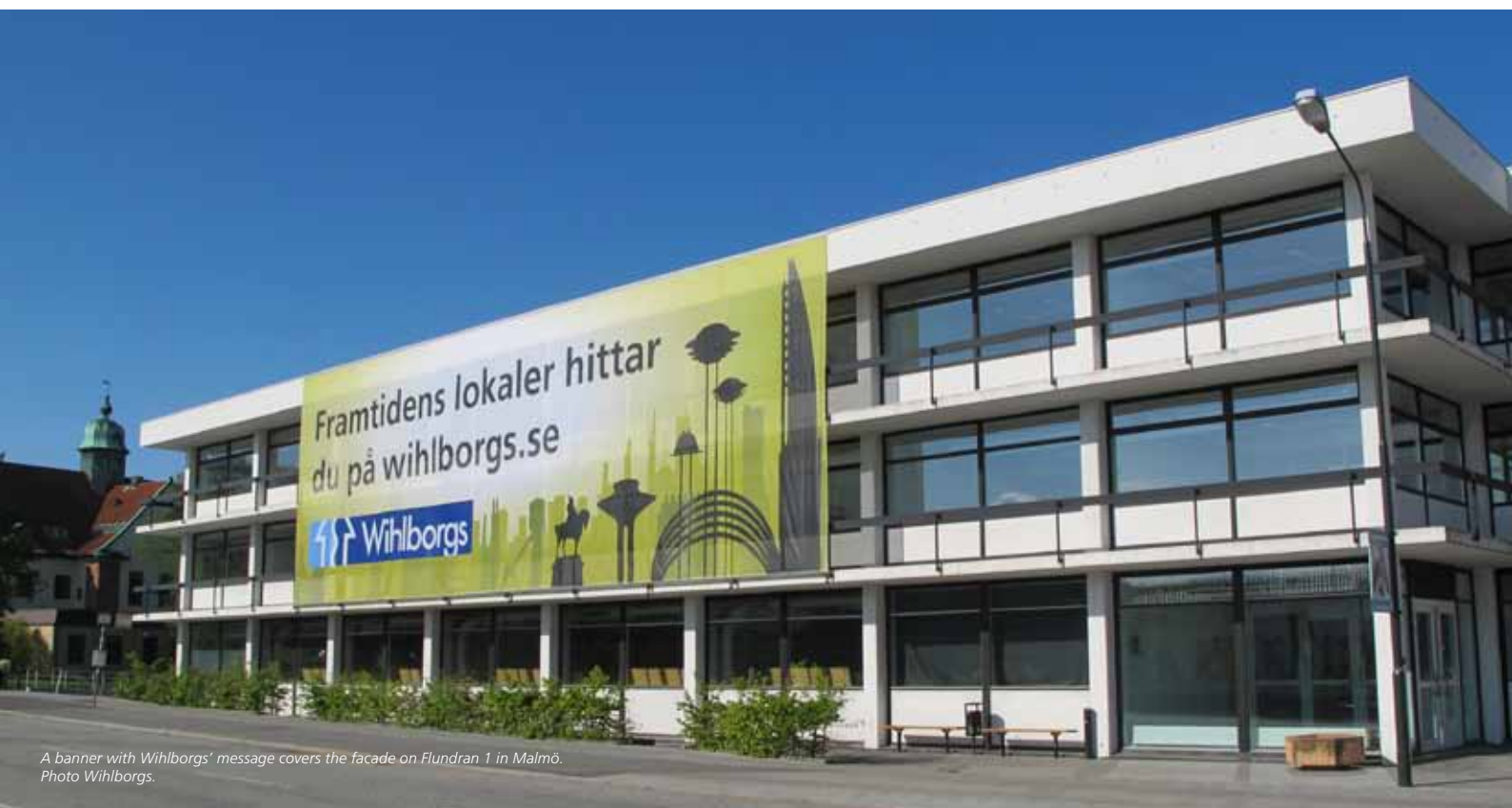
A banner with Wihlborgs' message covers the facade on Flundran 1 in Malmö.