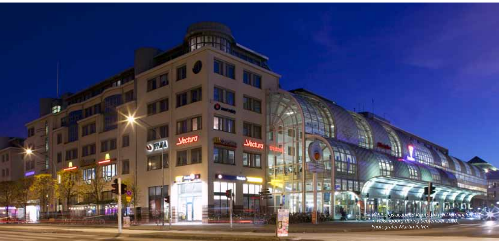
Wihlborgs acquired Knutpunkten (Terminalen 1) in Helsingborg during September 2010.

1. Operating income from properties acquired and sold are included in the net profit for the period.