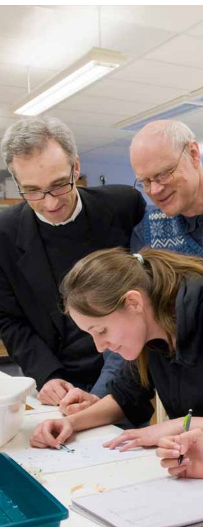
The Environmental Science program in Malmö University is located at Ubåtshallen and Kranen 2, Dockan.