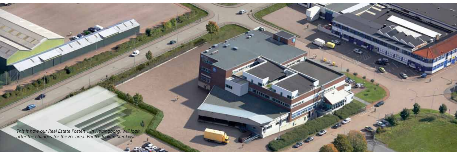
This is how our Real Estate Posten 1 in Helsingborg, will look after the changes for the H+ area.

2) Based on Wihlborgs property portfolio 101231.