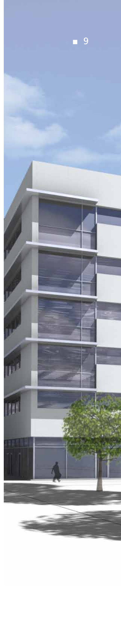
Fören will be the next office building at Dockan. The six floor tall building has three unique facades. Image: Henrik Jais-Nielsen & Mats White Arkitekter AB

The properties in Malmö and Helsingborg represented 85 per cent of the total rental value and 83 per cent of the properties' market value. The rental value for office and retail properties and industrial/warehouse properties totalled 72 and 27 per cent of the total rental value respectively. The operating surplus from properties held for investment is SEK 1,019m. This item also includes the costs of property administration amounting to SEK 55m. This cost therefore excludes the current operating surplus amounting to SEK 1,074m which, with a value of SEK 16,105m means a current yield of 6.7 per cent. When broken down according to property category this is 6.3 per cent for offices/retail and 8.2 per cent for industrial/warehouses.