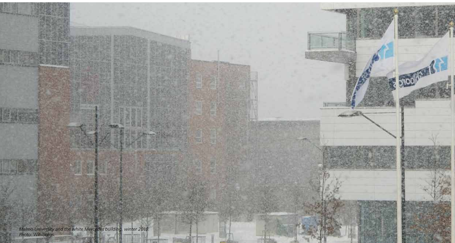
Malmö University and the white Mercedes building, winter 2010.