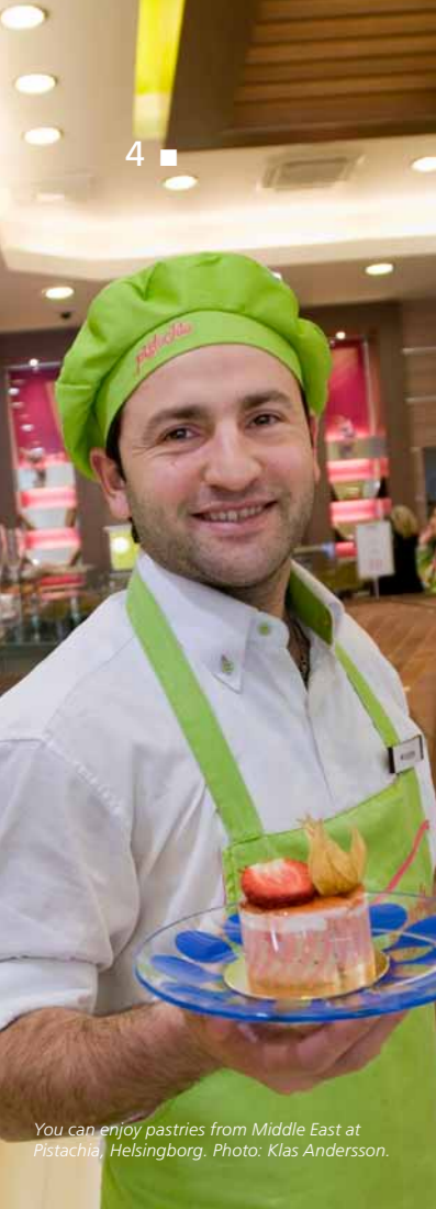
You can enjoy pastries from Middle East at Pistachia, Helsingborg.