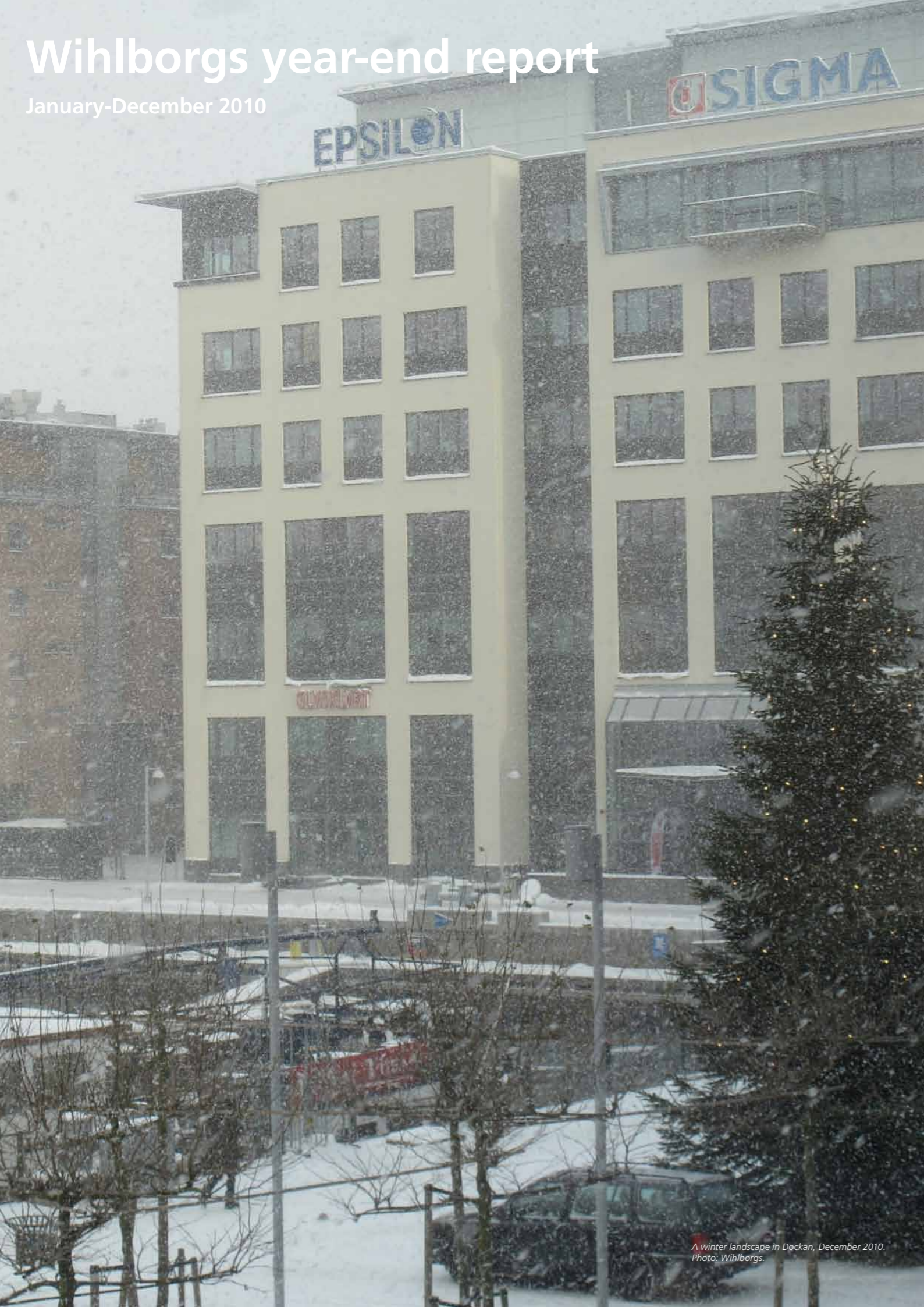
A winter landscape in Dockan, December 2010.